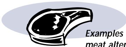
Examples of very lean or lean meat and meat alternative choices