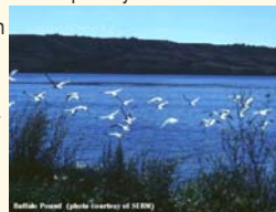
British Pig Grower